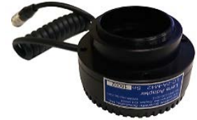
LC-2A-M42 (M42-Mount Lens Adapter)