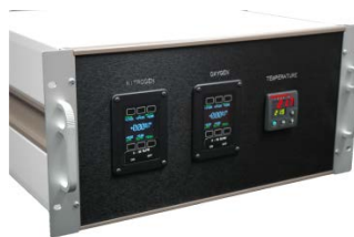
Control Box (CAL-04)