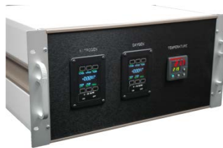
Control Box (CAL-04)